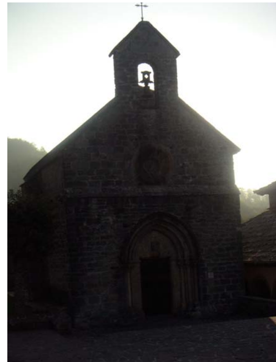
(Psalm 113) 3 From the rising of the sun to its setting the name of the LORD is to be praised.

Second Selection for October 11 (Psalm 113) 1 Praise the LORD! Praise, O servants of the LORD; praise the name of the LORD. 2 Blessed be the name of the LORD from this time on and forevermore. 3 From the rising of the sun to its setting the name of the LORD is to be praised. 4 The LORD is high above all nations, and his glory above the heavens. 5 Who is like the LORD our God, who is seated on high, 6 who looks far down on the heavens and the earth? 7 He raises the poor from the dust, and lifts the needy from the ash heap, 8 to make them sit with princes, with the princes of his people. 9 He gives the barren woman a home, making her the joyous mother of children. Praise the LORD!