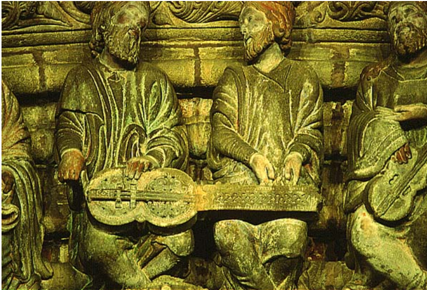
(Psalm 108) 2 Awake, O harp and lyre!