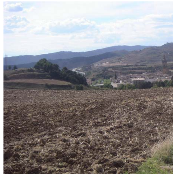
(Matthew 13)27 Master, did you not sow good seed in your field?

(Matthew 13) 24 He put before them another parable: "The kingdom of heaven may be compared to someone who sowed good seed in his field; 25 but while everybody was asleep, an enemy came and sowed weeds among the wheat, and then went away. 26 So when the plants came up and bore grain, then the weeds appeared as well. 27 And the slaves of the householder came and said to him, 'Master, did you not sow good seed in your field? Where, then, did these weeds come from?' 28 He answered, 'An enemy has done this.' The slaves said to him, 'Then do you want us to go and gather them?' 29 But he replied, 'No; for in gathering the weeds you would uproot the wheat along with them. 30 Let both of them grow together until the harvest; and at harvest time I will tell the reapers, Collect the weeds first and bind them in bundles to be burned, but gather the wheat into my barn.'"