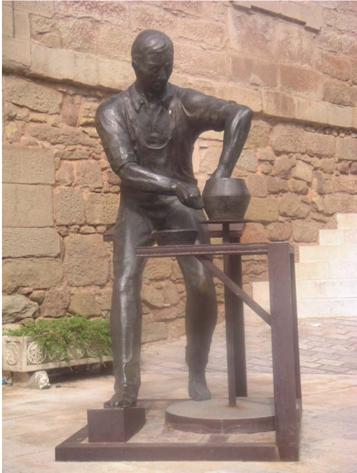
(Sirach 3) 17 My child, perform your tasks with humility

First Selection for October 11 (Sirach 3) 17 My child, perform your tasks with humility; then you will be loved by those whom God accepts. 18 The greater you are, the more you must humble yourself; so you will find favour in the sight of the LORD. 19 For great is the might of the LORD; but by the humble he is glorified.