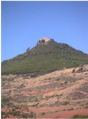
(Psalm 27) 5 He will set me high on a rock.

Selection for January 15 (Psalm 27) 1 The LORD is my light and my salvation; whom shall I fear? The LORD is the stronghold of my life; of whom shall I be afraid? 2 When evildoers assail me to devour my flesh-- my adversaries and foes-- they shall stumble and fall. 3 Though an army encamp against me, my heart shall not fear; though war rise up against me, yet I will be confident. 4 One thing I asked of the LORD, that will I seek after: to live in the house of the LORD all the days of my life, to behold the beauty of the LORD, and to inquire in his temple. 5 For he will hide me in his shelter in the day of trouble; he will conceal me under the cover of his tent; he will set me high on a rock. 6 Now my head is lifted up above my enemies all around me, and I will offer in his tent sacrifices with shouts of joy; I will sing and make melody to the LORD. 7 Hear, O LORD, when I cry aloud, be gracious to me and answer me! 8 "Come," my heart says, "seek his face!" Your face, LORD, do I seek.... 11 Teach me your way, O LORD, and lead me on a level path because of my enemies.... 13 I believe that I shall see the goodness of the LORD in the land of the living. 14 Wait for the LORD; be strong, and let your heart take courage; wait for the LORD!