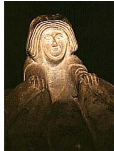
(January 16) 10 Just so, I tell you, there is joy in the presence of the angels of God over one sinner who repents.

Selection for January 16 (Luke 15) 1 Now all the tax collectors and sinners were coming near to listen to him. 2 And the Pharisees and the scribes were grumbling and saying, "This fellow welcomes sinners and eats with them." 3 So he told them this parable: 4 "Which one of you, having a hundred sheep and losing one of them, does not leave the ninety-nine in the wilderness and go after the one that is lost until he finds it? 5 When he has found it, he lays it on his shoulders and rejoices. 6 And when he comes home, he calls together his friends and neighbors, saying to them, 'Rejoice with me, for I have found my sheep that was lost.' 7 Just so, I tell you, there will be more joy in heaven over one sinner who repents than over ninety-nine righteous persons who need no repentance. 8 "Or what woman having ten silver coins, if she loses one of them, does not light a lamp, sweep the house, and search carefully until she finds it? 9 When she has found it, she calls together her friends and neighbors, saying, 'Rejoice with me, for I have found the coin that I had lost.' 10 Just so, I tell you, there is joy in the presence of the angels of God over one sinner who repents."