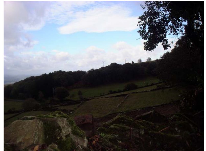
(Psalm 104) 2 You stretch out the heavens like a tent ....

the sea, great and wide, creeping things innumerable are there, living things both small and great. 26 There go the ships, and Leviathan that you formed to sport in it. 27 These all look to you to give them their food in due season; 28 when you give to them, they gather it up; when you open your hand, they are filled with good things. 29 When you hide your face, they are dismayed; when you take away their breath, they die and return to their dust. 30 When you send forth your spirit, they are created; and you renew the face of the ground. 31 May the glory of the LORD endure forever; may the LORD rejoice in his works-- 32 who looks on the earth and it trembles, who touches the mountains and they smoke. 33 I will sing to the LORD as long as I live; I will sing praise to my God while I have being. 34 May my meditation be pleasing to him, for I rejoice in the LORD. 35 Let sinners be consumed from the earth, and let the wicked be no more. Bless the LORD, O my soul. Praise the LORD!