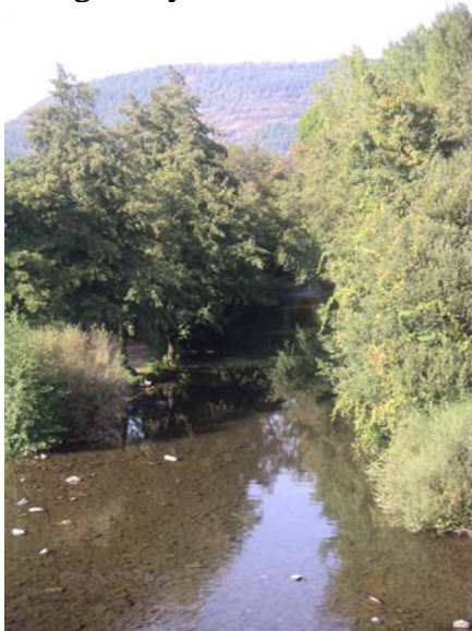
(Deuteronomy 8) 7 For the LORD your God is bringing you into a good land, a land with flowing streams....

Selection for February 9 (Deuteronomy 8) 6 Therefore keep the commandments of the LORD your God, by walking in his ways and by fearing him. 7 For the LORD your God is bringing you into a good land, a land with flowing streams, with springs and underground waters welling up in valleys and hills, 8 a land of wheat and barley, of vines and fig trees and pomegranates, a land of olive trees and honey, 9 a land where you may eat bread without scarcity, where you will lack nothing, a land whose stones are iron and from whose hills you may mine copper. 10 You shall eat your fill and bless the LORD your God for the good land that he has given you.