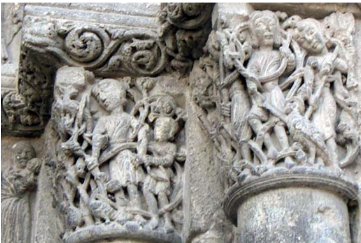
(Psalm 25) 15 My eyes are ever toward the LORD, for he will pluck my feet out of the net.