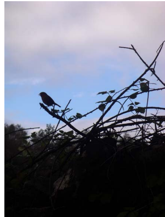
(Matthew 6) 26 Look at the birds of the air

value than they? 27 And can any of you by worrying add a single hour to your span of life? 28 And why do you worry about clothing? Consider the lilies of the field, how they grow; they neither toil nor spin, 29 yet I tell you, even Solomon in all his glory was not clothed like one of these. 30 But if God so clothes the grass of the field, which is alive today and tomorrow is thrown into the oven, will he not much more clothe you--you of little faith? 31 Therefore do not worry, saying, 'What will we eat?' or 'What will we drink?' or 'What will we wear?' .....[I]indeed your heavenly Father knows that you need all these things. 33 But strive first for the kingdom of God and his righteousness, and all these things will be given to you as well. 34 "So do not worry about tomorrow, for tomorrow will bring worries of its own. Today's trouble is enough for today."